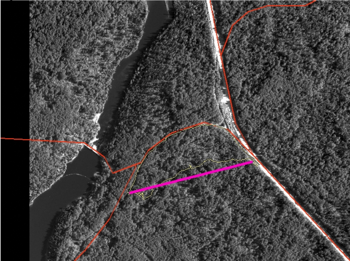
Fig 2. Proposed By Pass